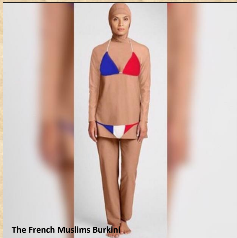
The French Muslims Burkini